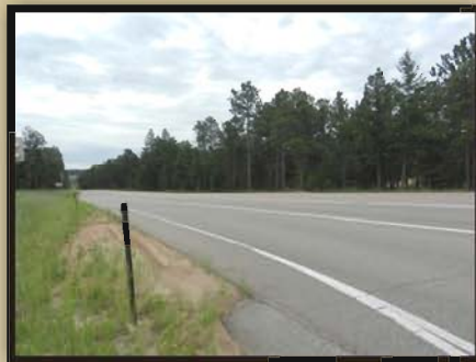
2-Lane section with Deceleration Lane