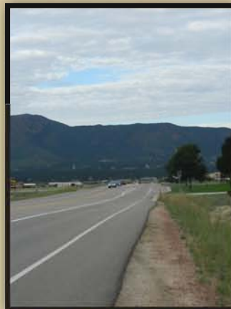
Rural to Urban Roadway Transition