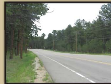
2-Lane section with center turn lane