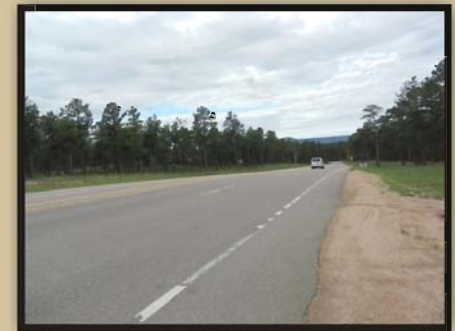
2-Lane section with acceleration lane