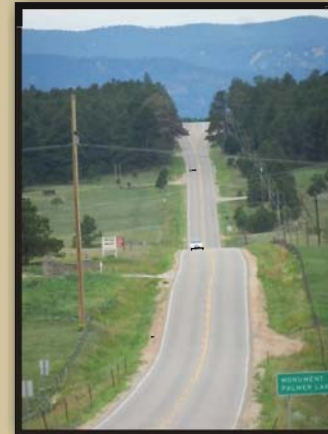
2-Lane section with variable shoulder widths